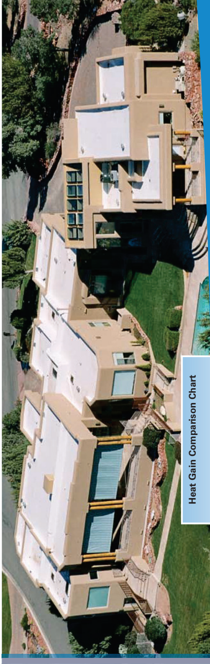
Heat Gain Comparison Chart

IB Roofs are uniquely formulated to withstand ponding water. Moisture will not pass through the IB membrane. Ponding water will not affect the performance or warranty of IB Roof Systems single-ply membranes.